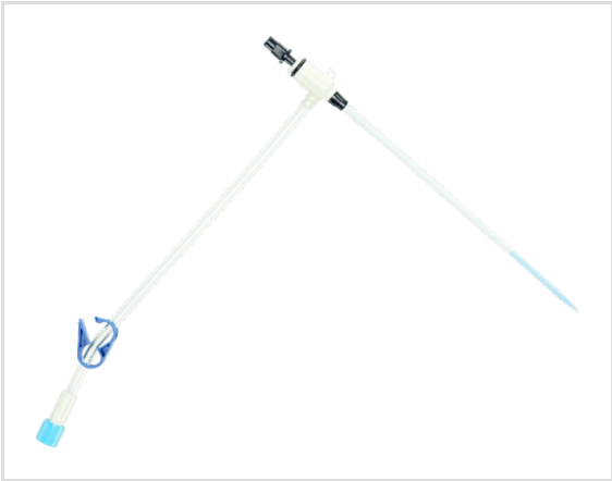
Representative photo(s): actual product specifications may vary from that shown in the photo