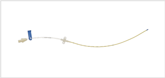
Representative photo(s): actual product specifications may vary from that shown in the photo