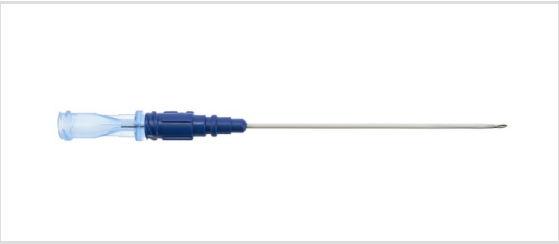
Representative photo(s): actual product specifications may vary from that shown in the photo